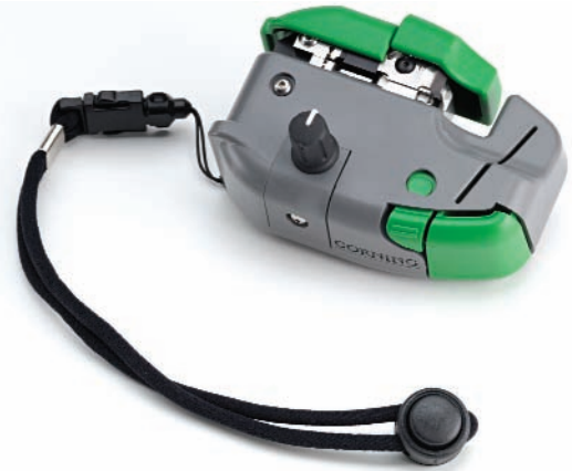
OptiSnap Field Cleaver | Photo CCA206