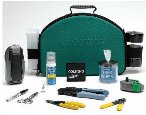
OptiSnap™ Tool Kit | Photo CCA203