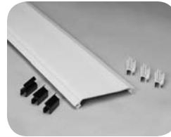
Hinged Cover for Horizontal Straight Section (FGS-MSNC-A)