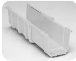
Expandable Straight Section (FGS-MVAR-A)