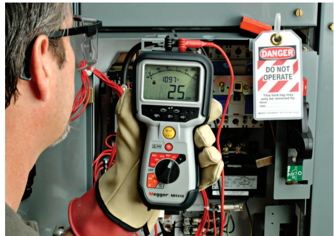
Panelboard testing is faster, easier and safer with the new MIT400 Series.