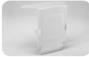
Cover for 4x4 Downspout (FGS-MCDS-AB)