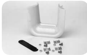
Trumpet Flare (FGS-MTRM-A)