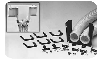
Dual 2" Flex Tube Attachment (FGS-KT03-A)