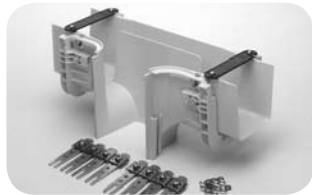
Insertable Downspout (FGS-MDSP-A/I)