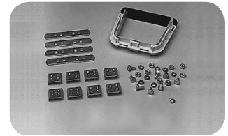
Downspout Exit Junction Kit (FGS-MJWR-A)