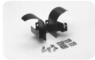
4x4/4x6 Downspout Insert (FGS-HDSI-AB)