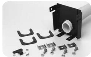
Single 2" Flex Tube Attachment (FGS-KT03-A1)