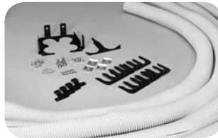
2" Quad Flex Tube Attachment (FGS-KT03-A4)