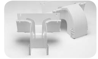
Extended Downspout (FGS-MDSP-EX-A) shown with and without cover